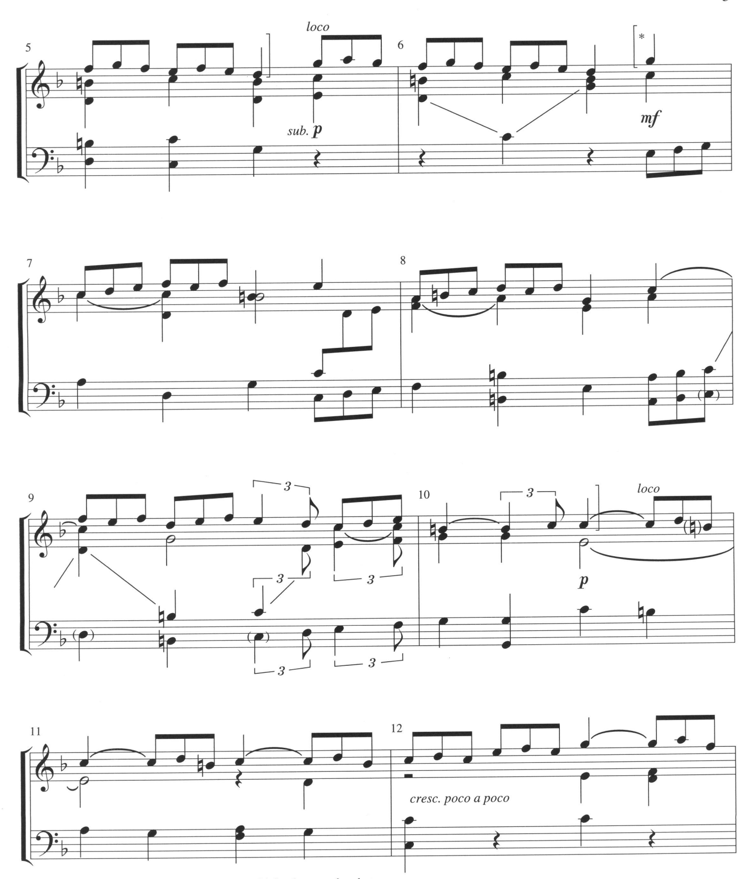
* 4 and 5 octave sets double melody an octave higher between brackets.